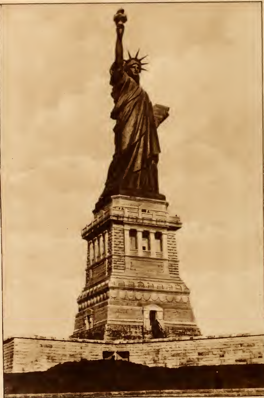
THE STATUE OF LIBERTY, a gift of the French people to the United States, is the work of Bartholdi, the famous French sculptor.